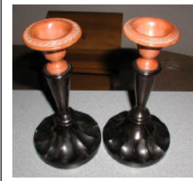
Freddy Dutton matched ebony with pink ivory and added a chatterwork rim. Right: Jim Snyder's candlestick with carved open center.