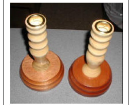
Chuck Murray's apple wood candlesticks with contrasting base.