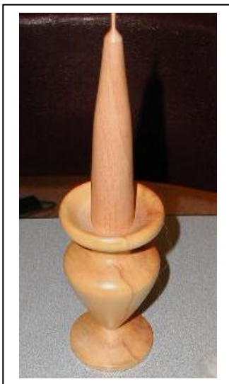
Candlesticks clockwise from upper left: A Walnut pair from Floyd Anstaett, Chuck Kemp's 1978 wall sconce, Jean Hock's birthday candlestick, two nice pieces from Ron Fisher, and Neal Springer's Box elder, complete with woode n candle.