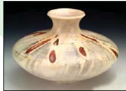
Barbara Crockett - "Norfolk Island Pine Hollow Form" 8x10x10 - Norfolk Island pine, water-based polyurethane $400