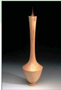
Jim Burrowes - "Tall Ash Vase" 19x5x5 - ash, cocobolo $600

Ohio Designer Craftsmen (ODC) is a nonprofit organization dedicated to promoting awareness and appreciation of fine craft. With more than 2,000 members in 44 states and Canada, ODC, in its 43rd year, is one of the premier craft organizations in the United States. Learn more at http://www.ohiocrafts.org .