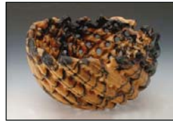
Andi Wolfe - "Imagine the Hidden World #4" 4.25x2.25x2.25 - marbled ebony $900