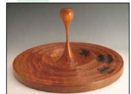
Mark Damron - "April Showers" 8x14x14 - mahogany $500