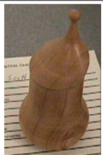
Scott Hogsten's unusually shaped box