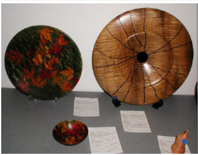
A few of Andi Wolfe's turnings including Shattered Dreams , which was rescued by using an ebony plug.