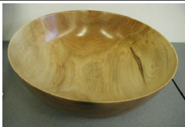
Craig shows us Ron Damon's maple bowl (below). Above is a more detailed picture.