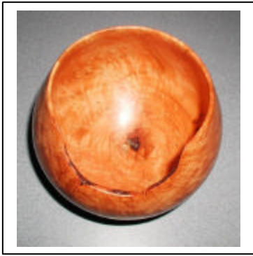
Ron Fisher's cherry bowl (top) and Tip House's natural edge bowl (bottom)