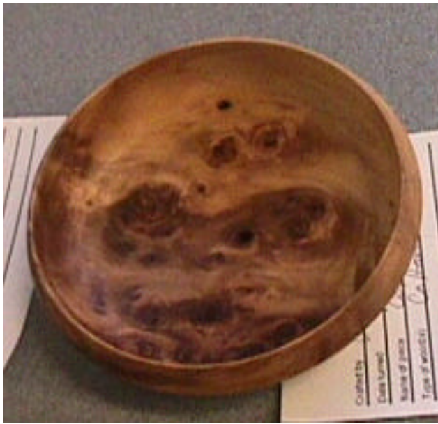
Chuck Kemp's cottonwood bowl