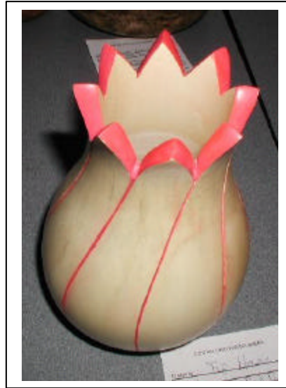
Tip House's hand painted vase