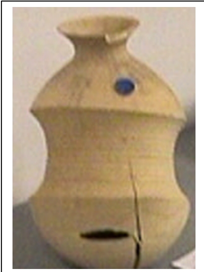
Jim Burrow's multi-axis hollow form