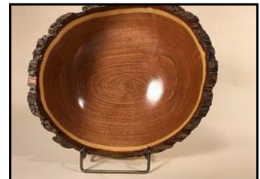
Natural edged bowl

Source: The Woodbook by Romeyn Beck Hough