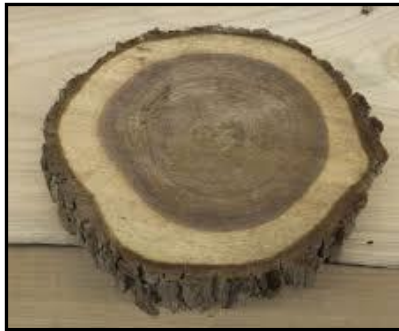
Black mesquite log