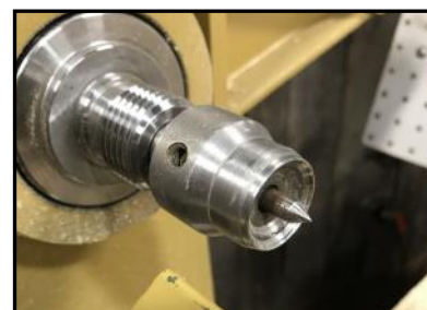
Safety Drive Center

We also saw how he can make multiple copies of wooden dolls that a local artist paints.